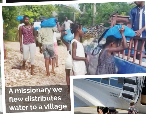
A missionary we flew distributes water to a village