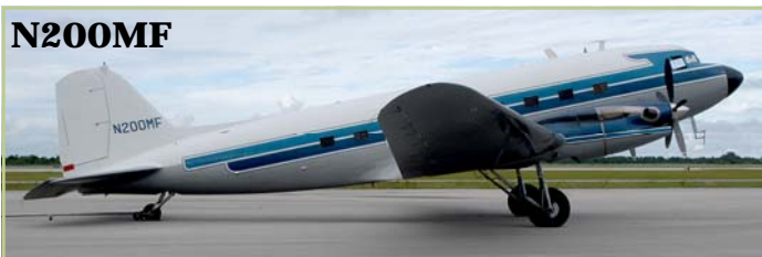
N200MF - painted in 2008