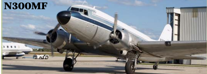
N300MF - last painted 1996